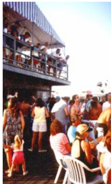
Parrotheads on Block Island

hats and collectibles at every performance to benefit the Alzheimer's Association. Check our Web site to order KWT CDs and other stuff. Call KWT TODAY (203-466-7286) to reserve your next "Pirate Looks At ?# Party" before all the dates are gone!!